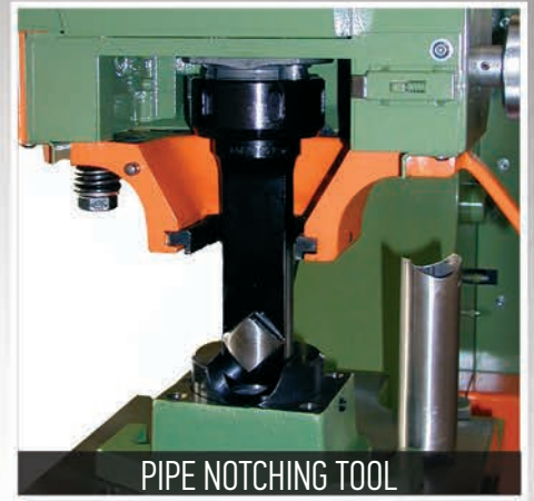
PIPE NOTCHING TOOL