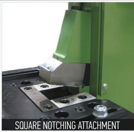
SQUARE NOTCHING ATTACHMENT